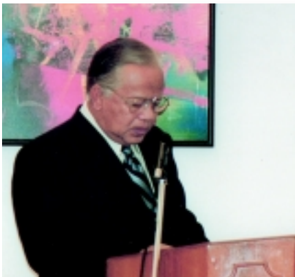
Yang Berhormat Tan Sri Khalil Yaakob, Minister of Information, Malaysia delivering his key note address to the delegates