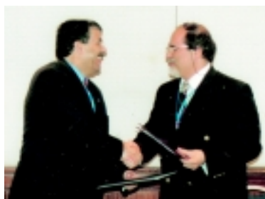
Handshake seals future cooperation