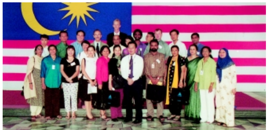
Visit to Radio Television Malaysia