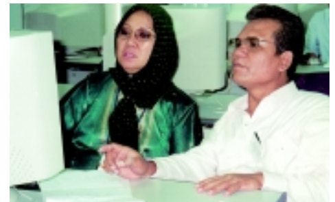
Practise session on one to one coaching.....