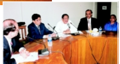
In the Concluding Ceremony Honorable Minister for Information Mr Tariquul Islam is delivering the concluding speech