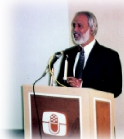
Dr. Abdul Moyeen Khan, The Honorable Minister for Science, Information and Communication Technology, Bangladesh delivering a key-note address in PSB Seminar, Dhaka

In the concluding Ceremony Honorable Minister for Information Mr Tariquul Islam gave concluding speech.