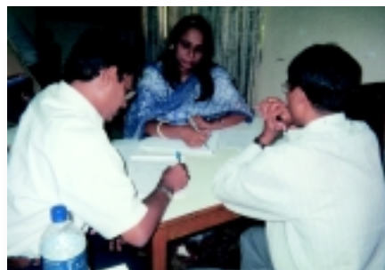
Working on group projects....

The AIBD's 'Training of Trainers' (TOT) course has standardized structure and curriculum. This was suitably oriented to meet the specific needs of the participants. In addition to specific content covered on adult learning techniques the subject areas included techniques for effective transfer of knowledge / skills to the trainees and evaluation measures to ascertain effectiveness of the training.