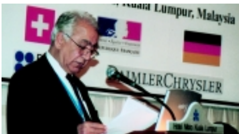
Afghanistan update, Hon. Abdul Hameed Mubarez, Deputy Minister of Information & Publication